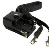
Heavy Duty Carrying Case